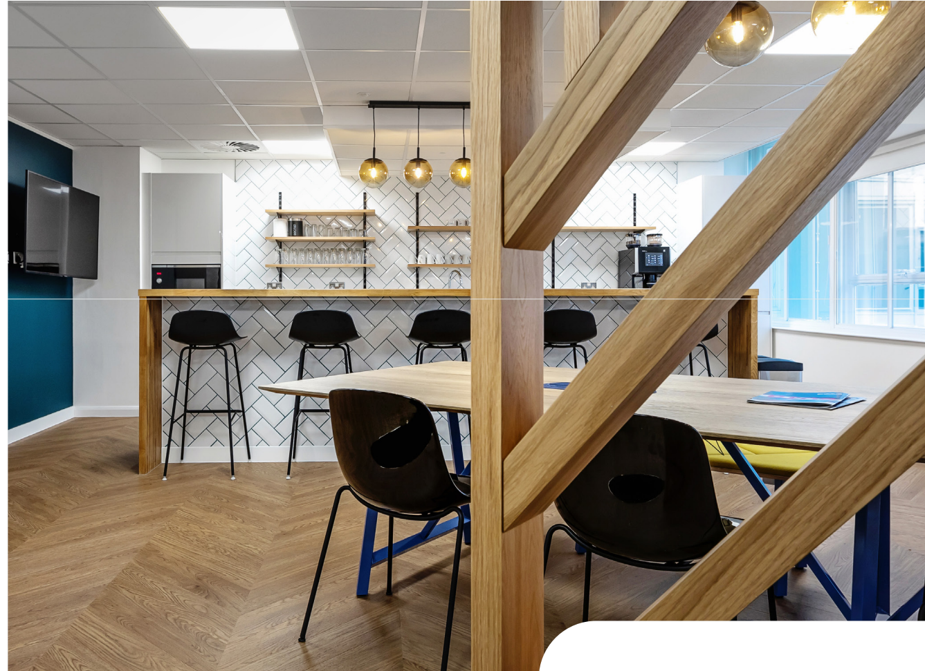
TSA Riley - Croydon Office

TSA Riley have over 35 Counsellors and 9 Regional Coaches